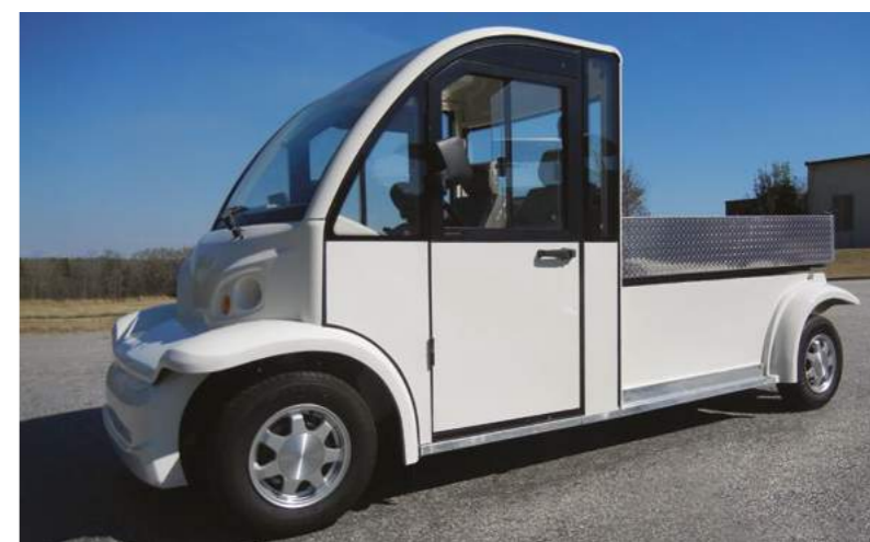
STAR AK48-2 Long ↑ The flexible carry-all with 7 HP AC Electric Drive motor and 450 amp programmable speed controller.

Reesink is back with an electric solution for transporting people and cargo around grounds, courses, stadiums and leisure venues. The STAR Capella Work Machine with caged body will appear alongside the newest addition to the line-up – the STAR AK48-2 Long with door option. This two-seat utility vehicle offers multiple cargo configurations and the next generation of customer-focused features. Also on stand is the KAASPEED scooter , configured with its shopping tray option, the new, effective and fun method of transport for guests and visitors.