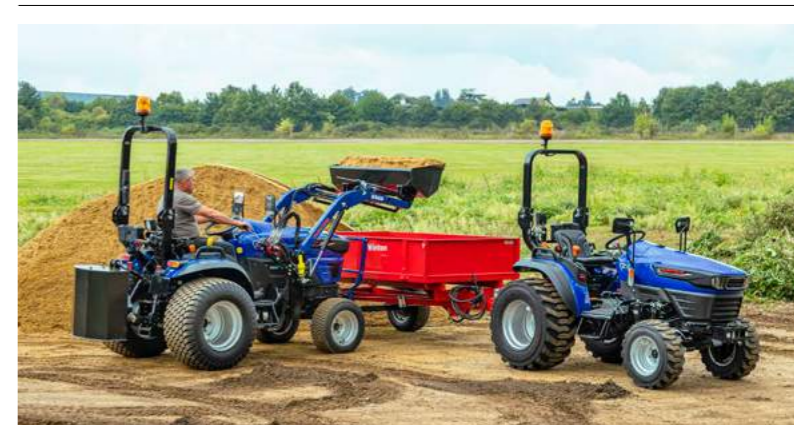
Farmtrac 25G ↑ All the functions and features of a compact tractor, with the benefits of electric power.

Providing powerful performance in a compact and easily-maneuvrable package is the award-winning Farmtrac FT25G electric compact tractor that has impressed the industry's electric vehicles and technology enthusiasts. Plus customer favourite FT26H with ROPS. Both are ideal for smallholders, equestrian centres and landscapers looking for quieter eco-friendlier alternatives and anyone likely to work in tight spaces, as the compact machines with narrow bodies move through everyday tasks with ease and efficiency.